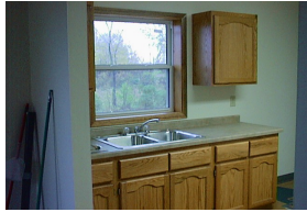
This is a picture of part of a typical kitchen in our houses

WE BUILD AND RENOVATE SIMPLE, DECENT HOMES WHICH THE WORKING POOR CAN AFFORD TO BUY. WE ARE AN EQUAL OPPORTUNITY CHRISTIAN ORGANIZATION AFFILIATED WITH HABITAT FOR HUMANITY INTERNATIONAL. WE DO NOT "GIVE AWAY" HOUSES. FAMILIES WHO QUALIFY PAY