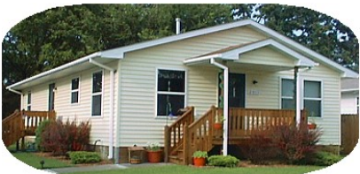
Example of one of our houses.

HABITAT FOR HUMANITY WORKS IN PARTNERSHIP WITH GOD AND PEOPLE EVERYWHERE, FROM ALL WALKS OF LIFE, TO DEVELOP COMMUNITIES WITH PEOPLE IN NEED BY BUILDING AND RENOVATING HOUSES SO THAT THERE ARE DECENT COMMUNITIES IN WHICH EVERY PERSON CAN EXPERIENCE GOD'S LOVE AND CAN LIVE AND GROW INTO ALL THAT GOD INTENDS.